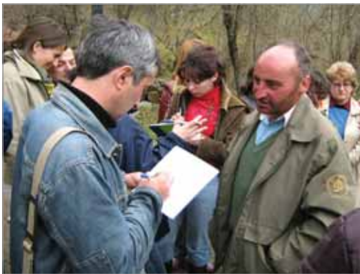
The International Center for Journalists environmental reporting workshop in Georgia